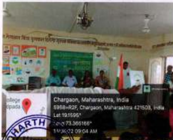
Chargaon, Maharashtra, India 5958+R2F, Chargaon, Maharashtra 421503, India Lat 19.1595° Long 73.365188° 13/08/22 09:04 AM