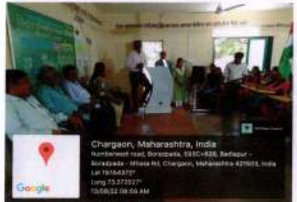
Chargaon, Maharashtra, India Numbered road, Boradpada, 593C+638, Badapur - Boradpada - Mhasa Rd, Chargaon, Maharashtra 421503, India Lat 19.154372° Long 73.372527° 13/08/22 08:59 AM