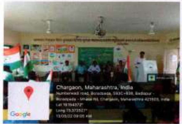
Chargaon, Maharashtra, India Numbered road, Boradpada, 593C+638, Badapur - Boradpada - Mhasa Rd, Chargaon, Maharashtra 421503, India Lat 19.154372° Long 73.372527° 13/08/22 09:01 AM