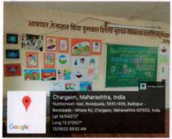
Chargaon, Maharashtra, India Numbered road, Boradpada, 593C+638, Badapur - Boradpada - Mhasa Rd, Chargaon, Maharashtra 421503, India Lat 19.154372° Long 73.372527° 13/08/22 08:52 AM