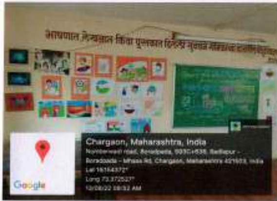
Chargaon, Maharashtra, India Numbered road, Boradpada, 593C+638, Badapur - Boradpada - Mhasa Rd, Chargaon, Maharashtra 421503, India Lat 19.154372° Long 73.372527° 13/08/22 08:52 AM