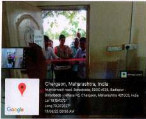
Chargaon, Maharashtra, India Numbered road, Boradpada, 593C+638, Badapur - Boradpada - Mhasa Rd, Chargaon, Maharashtra 421503, India Lat 19.154372° Long 73.372527° 13/08/22 08:56 AM