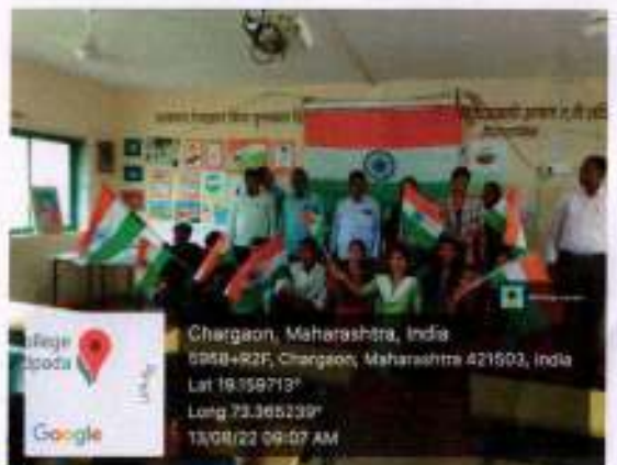
Chargaon, Maharashtra, India 5958+R2F, Chargaon, Maharashtra 421503, India Lat 19.159713° Long 73.365239° 13/08/22 09:07 AM