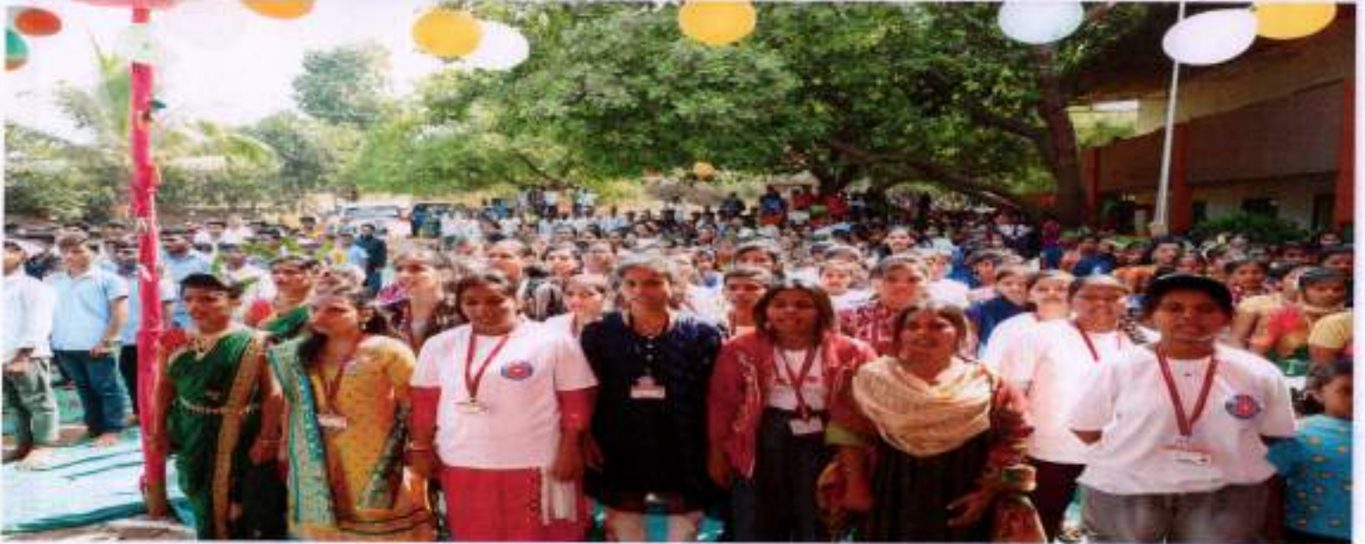
Sadhubella Girls College Ulhasnagar Students enjoyed the Annual Day Festival