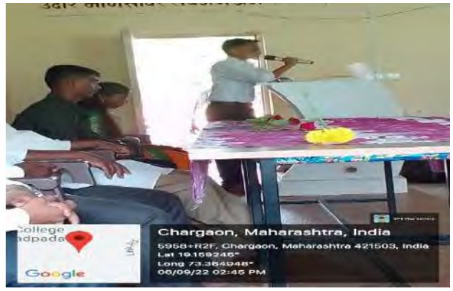
College adpada Chargaon, Maharashtra, India 5958+R2F, Chargaon, Maharashtra 421503, India Lat 19.159245° Long 73.364948° 06/09/22 02:45 PM