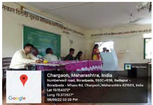
Chargaon, Maharashtra, India Numberwadi road, Boradpada, 593C+638, Badlapur - Boradpada - Mhasa Rd, Chargaon, Maharashtra 421503, India Lat 19.154372° Long 73.372527° 06/09/22 02:29 PM