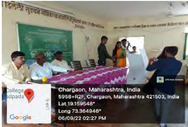
College adpada Chargaon, Maharashtra, India 5958+R2F, Chargaon, Maharashtra 421503, India Lat 19.159548° Long 73.364946° 06/09/22 02:27 PM