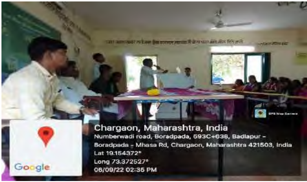
Chargaon, Maharashtra, India Numberwadi road, Boradpada, 593C+638, Badlapur - Boradpada - Mhasa Rd, Chargaon, Maharashtra 421503, India Lat 19.154372° Long 73.372527° 06/09/22 02:35 PM