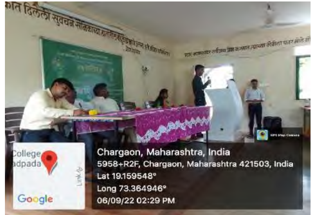
College adpada Chargaon, Maharashtra, India 5958+R2F, Chargaon, Maharashtra 421503, India Lat 19.159548° Long 73.364946° 06/09/22 02:29 PM