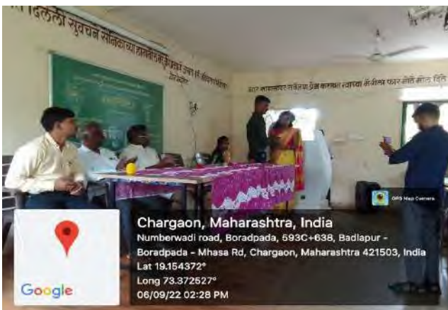
Chargaon, Maharashtra, India Numberwadi road, Boradpada, 593C+638, Badlapur - Boradpada - Mhasa Rd, Chargaon, Maharashtra 421503, India Lat 19.154372° Long 73.372527° 06/09/22 02:28 PM