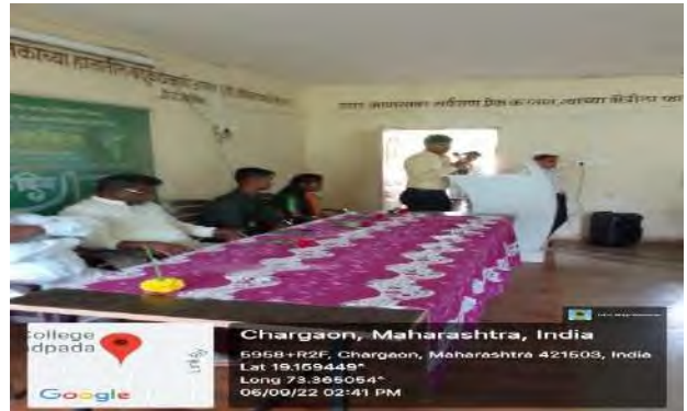
College adpada Chargaon, Maharashtra, India 5958+R2F, Chargaon, Maharashtra 421503, India Lat 19.159449° Long 73.365054° 06/09/22 02:41 PM