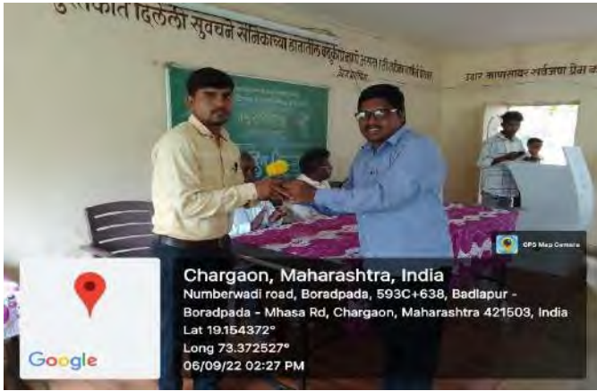
Chargaon, Maharashtra, India Numberwadi road, Boradpada, 593C+638, Badlapur - Boradpada - Mhasa Rd, Chargaon, Maharashtra 421503, India Lat 19.154372° Long 73.372527° 06/09/22 02:27 PM